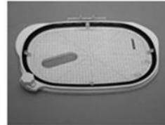
Model BERNINA® B185,200,430,440,630,640,730,& 830