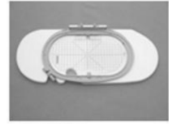
Model BERNINA® B185,200,430,440,630,640,&730